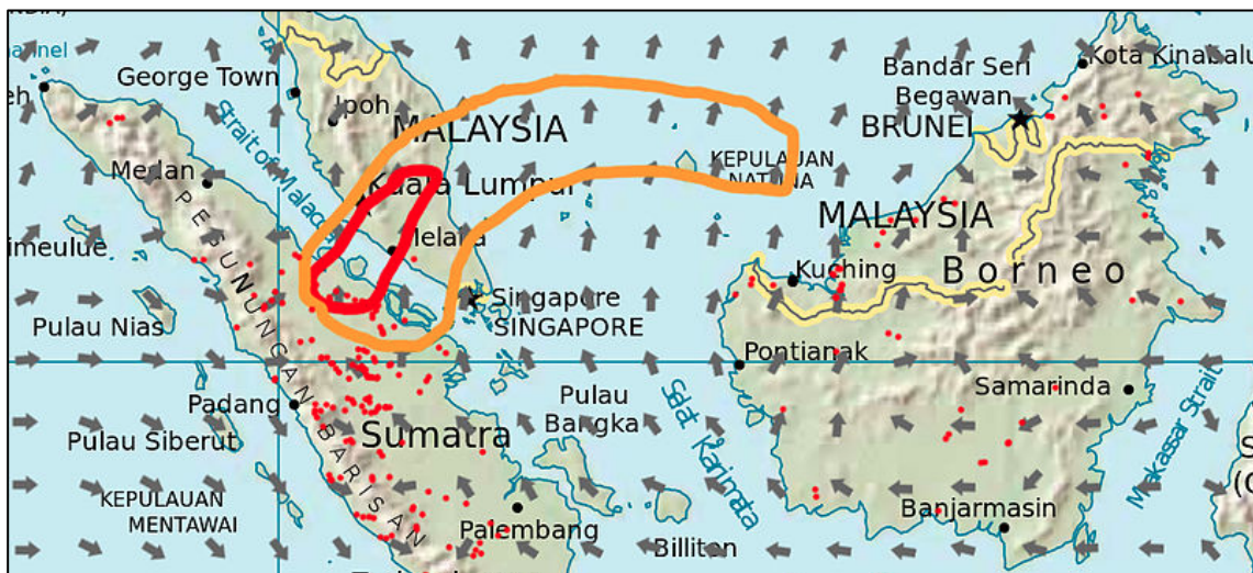
Figure 1 Map showing extent of 2013 Southeast Asian haze as of 23 June 2013 2

The 2013 haze episode (see Figure 1) was more severe than in previous years and led to the closure of kindergartens and schools, suspension of commercial services and restricted outdoor recreational activity. On 23 June, Malaysia's Prime Minister Najib declared a state of emergency in two districts, Muar and Ledang. On the morning of 25 June, the Air Pollution Index value hit a record of 487 ("Very Unhealthy") in Port Klang. The haze forced the opening ceremony of the 13 th Parliament session in Kuala Lumpur to be held indoors for the first time in Malaysian history.