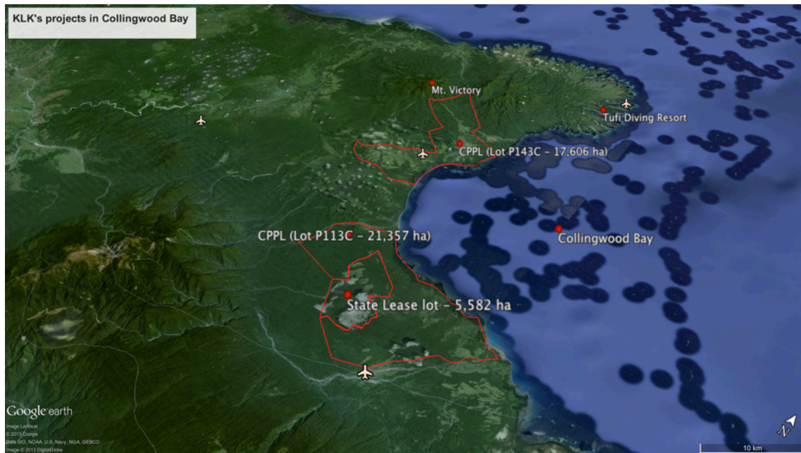
Figure 12 CPPL's claimed land banks in Collingwood Bay, Papua New Guinea

Furthermore, KKK's SABLs were issued in July 2012 (see Figure 13) even though a national moratorium policy on the issuance of SABLs on customary land had been in place from July 2011 onward. The moratorium was called to enable an independent Commission of Inquiry (CoI) to look into the legality of SABLs. The CoI completed its report on 24 June 2013. It had found widespread abuse, fraud, lack of coordination between agencies of government, failure and incompetence of government officials to ensure compliance, accountability and transparency within SABL process from application stage to registration, processing, approval and granting of the SABL. It was estimated that over 5.2 million hectares of customary land around the country had been alienated, mostly for 'special agriculture activities' over virgin forest tracts containing tropical hardwoods.