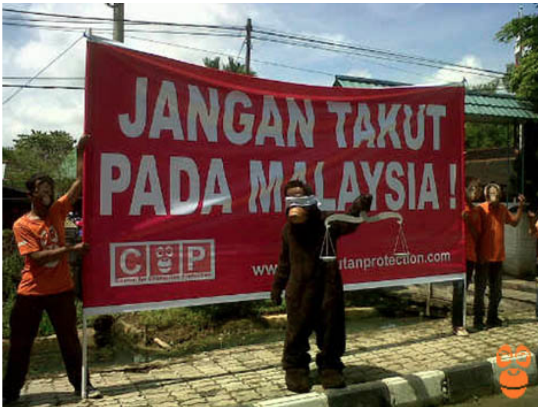
Figure 4 Centre for Orang-utan Protection demonstration against PT KAM 64

During subsequent proceedings, the court heard that two PT KAM employees confessing they had chased down 20 orang-utans and other primates with dogs, then shooting, stabbing or hacking them to death with machetes between 2008 and 2010. Most of the orang-utans did not die instantly after being shot but were left seriously injured and immobilized. The pair then tied up the orang-utans and left them to die from blood loss, hunger or attack from stray dogs. It was established that the company paid Rp 200,000 ($22) per monkey and Rp 1 million per orang-utan killed.