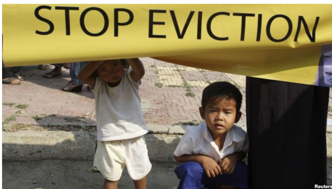
Figure 6 Cambodian farmers and their families are often violently evicted from their land to facilitate Economic Land Concessions (picture: Kratie Province, May 2012). 91

It remains to be seen how sustainable LFIB's plantation projects in Cambodia will be. In 1998, Kumpulan Europlus (better known as the developer and toll manager of the planned West-Coast Expressway Project in Malaysia) obtained rights, through its subsidiary Talam Plantation Holdings Sdn Bhd to develop oil palm plantations in Koh Kong province, Cambodia, but saw its 22,771 ha ELC cancelled in 2006. 92 In 2011, Golden Land Berhad, a Malaysian palm oil company from Sabah, attempted to acquire two ELCs (for in total about 23,000 ha) in Koh Kong Province through a Hong Kong based subsidiary and a Cambodian agent. In August 2012, however, Golden Land cancelled the contract with its agent for failing to deliver on its terms. 93