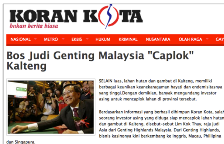
Figure 8 Indonesian media depicting gambling boss as chopping up Central Kalimantan 112

PT Dwie Warna Karya, PT Susantri Permai and PT Kapuas Maju Jaya deforested vast tracts of forestland and community land within a few years, affecting the livelihoods of local villagers. 110 Genting's activities have attracted the attention of critical media, accusing Genting Group of annexing Kalimantan. In addition to its three concessions in Central Kapuas, Genting Group acquired another three estate companies on the peatlands of Kapuas and South Barito Districts in 2012 and 2013. 111