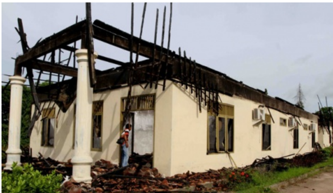
Figure 5 All residential facilities in PT BSMI were destroyed during a mass riot in February 2012, following an earlier uprising against the company in November 2011. 70

Tempo Magazine also reported that the community leaders and residents of eight villages agreed to ask PT BSMI and PT Lampung Indah Pertiwi (PT LIP) to leave. 71 Following the second riot, the company finally suspended its operations on the ground in January 2013. PT BSMI had reported loss over RM1.1m in turn over as result of damages to assets. 72 Chin Teck's share value remained unaffected by the events in Mesuji. In April 2013, RHB's Research Team evaluated Chin Teck as "a jewel in the rubble in Malaysia's plantations universe" . 73