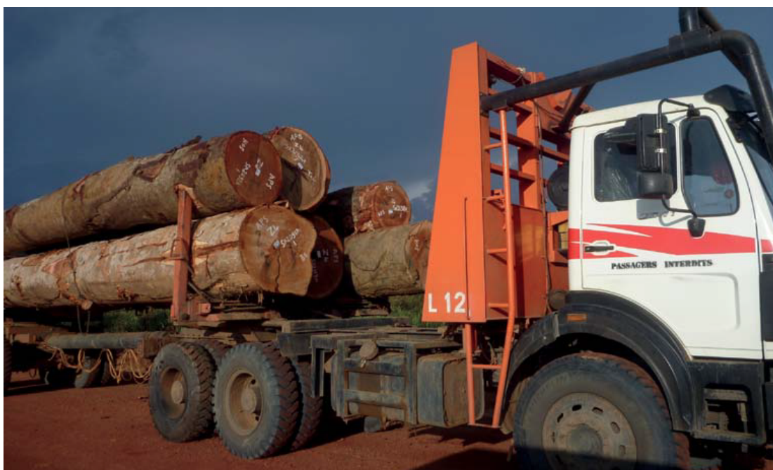
Figure 7 Atama logs from forest clearance for oil palm, December 2012 100

Rainforest Foundation noted that questions remain about Atama Plantations' ultimate ownership. It found evidence that "the same companies which controlled Atama prior to Wah Seong's involvement (and continue to hold a large minority stake) have been used on more than one occasion to shield the identity of individuals found guilty of serious offences." 101 In this light, Wah Seong's connections in Malaysia are politically significant. The younger brother of Malaysia's Prime Minister Datuk Seri Najib Tun Razak, Datuk Mohamed Nizam Abdul Razak, has equity interest in Wah Seong and some of its units. 102