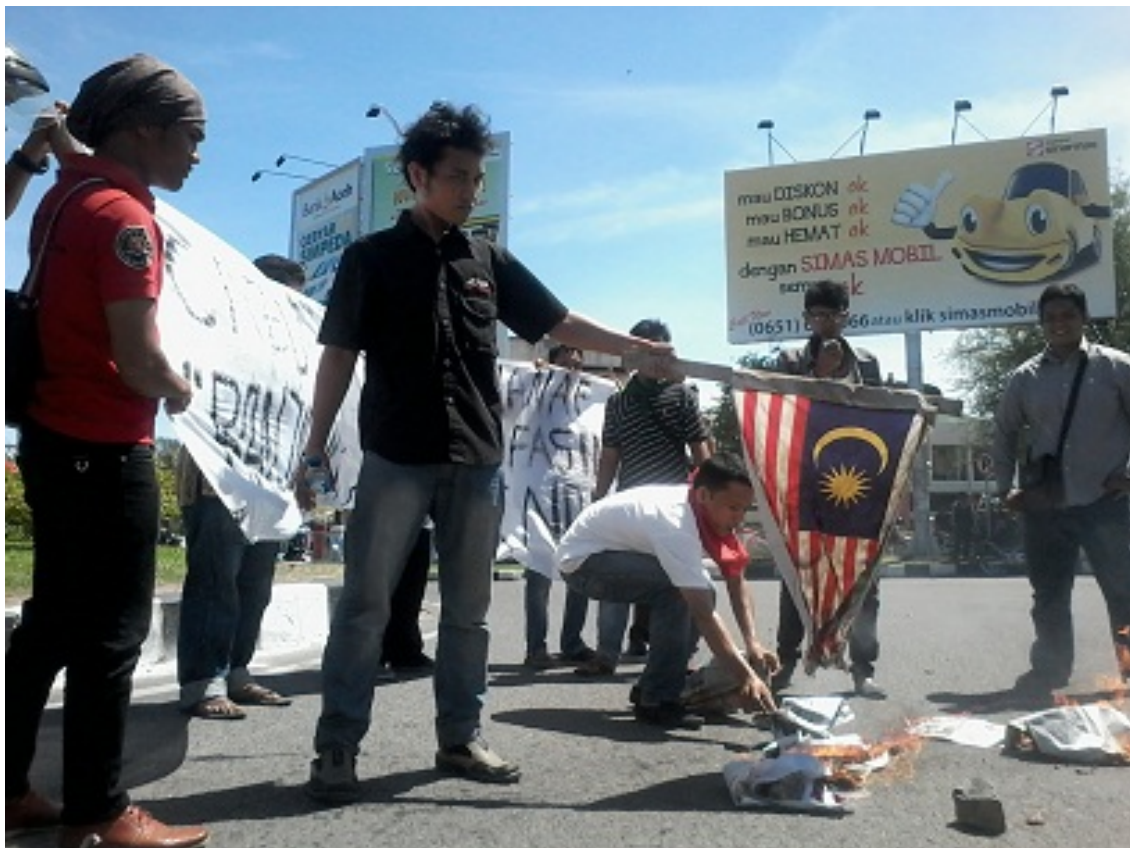
Figure 3 Indonesian students burning of the Malaysian Jalur Gemilang in Banda Aceh during a demonstration calling for the withdrawal of the PT Nafasindo land use permit 60

Nafas is one among other Malaysian plantation companies operating in Aceh. Guthrie (Sime Darby/Minamas Gemilang today) have been operating in the province since the 1990s and have faced many challenges during the insurgency that forced the company to pay Mobile Brigade (Brimob) paramilitary police personnel to protect their estate. After the 2005 peace agreement, the then temporary Governor of Aceh, Mustafa Abubakar, discussed the possibility of making special provision for private companies from Malaysia to open up palm plantations in Aceh. At that time 100,000 ha of land in Aceh Besar area was offered to Malaysian investors. 61 Aceh's next Governor Irwady Yusuf continued this open door policy, which was welcomed by Malaysian palm oil companies whom formed the Aceh Plantation Development Authority (APDA) in collaboration with Acehnese business people. 62 Various media reports stated that APDA plans to open 145,000 hectares of oil palm plantations in the province, supported by YaPEIM (Islamic Economy Development Foundation Malaysia). The plantations would supply oil palm kernels to thirteen CPO factories, with a total investment of US$ 488 million. 63 However, the plan has not been heard of since.