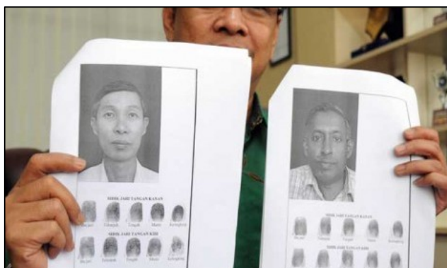
Figure 2 In 2013, Indonesian immigration sent out orders to prevent two KLK's managers from leaving the country. The two under police investigation for having allowed and helped villagers to clear land by the use of fire 12